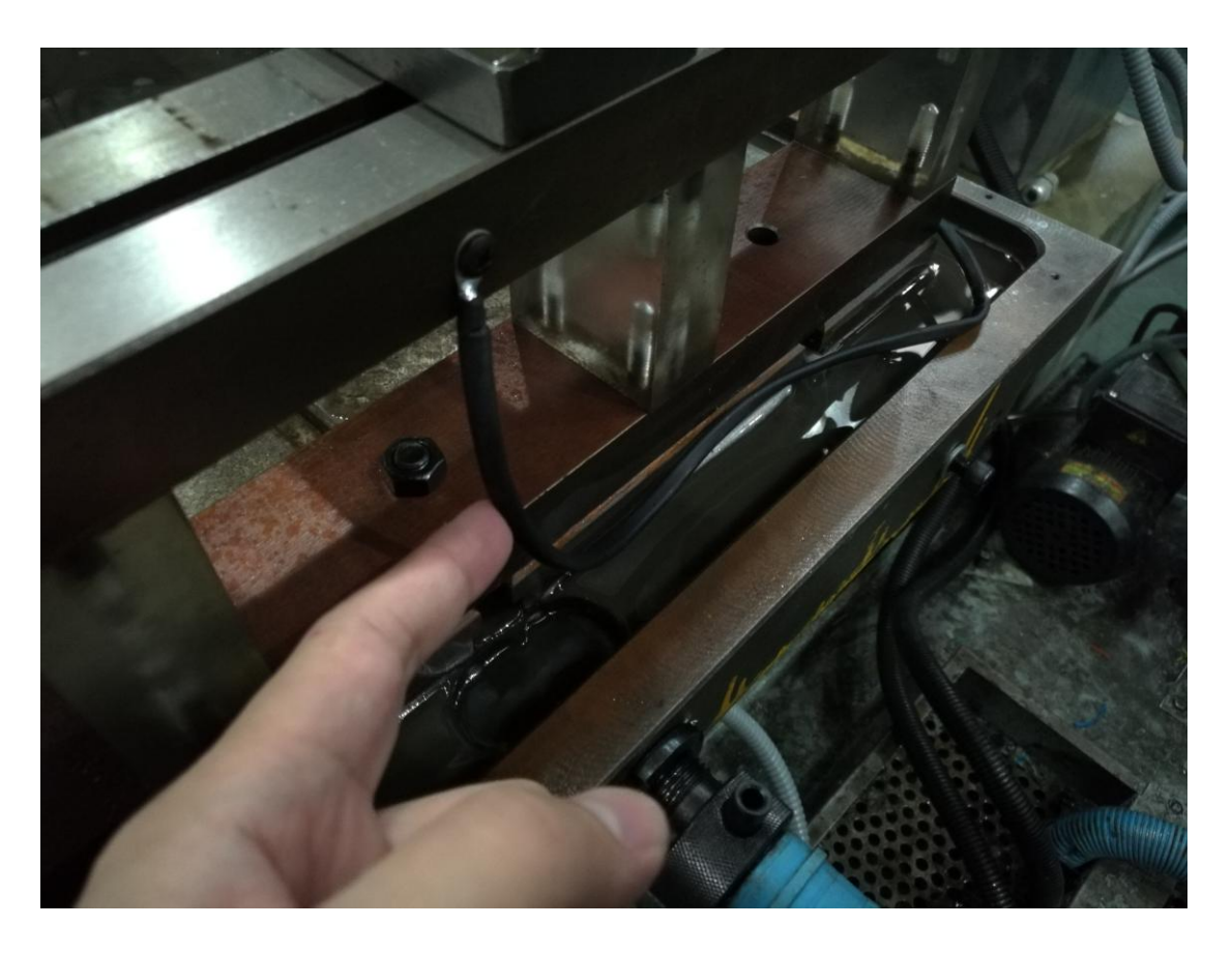
If above wire is not problem, please check following two wire.

1, if the machine can spark, please check the wire on table, please see following photo. This wire maybe break because of the workpiece fall. 80% is this wire, please check this carefully.